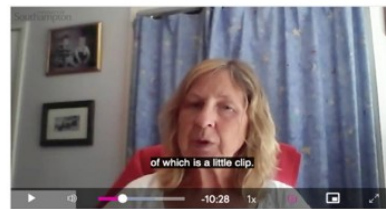
View transcript Download video: standard